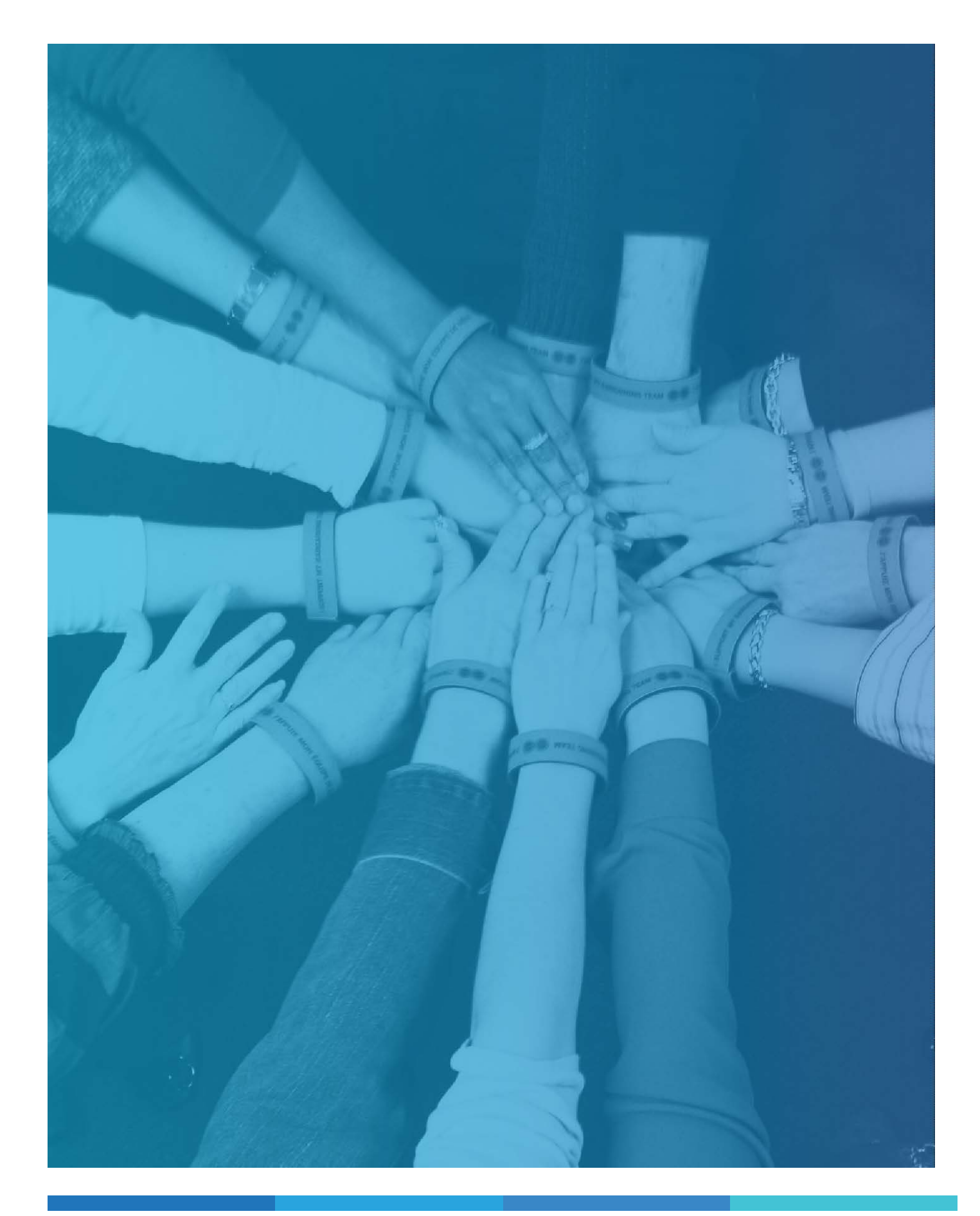
PSAC Regional Human Rights & Regional Equity Committee Handbook